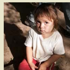
Keep us in your prayers